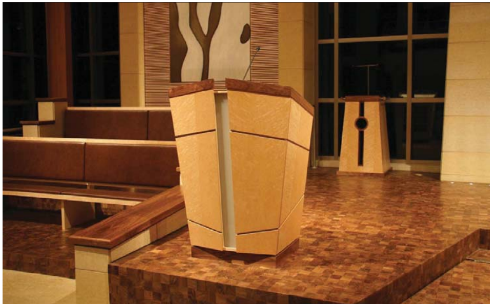
▼ THE UNIQUELY DESIGNED PULPIT is custom fabricated of Maple.